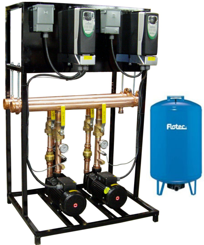
All parts shown included Actual system components may vary Some assembly required